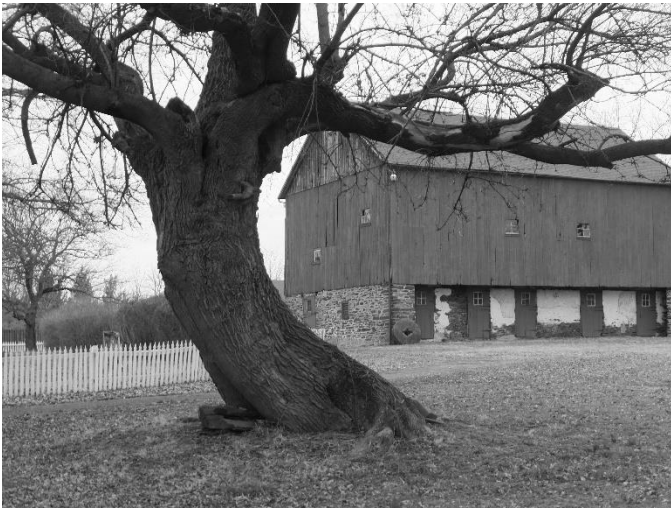
Our White Mulberry Tree

were considered worthless, and, in many cases, they were torn up and thrown away. Still, the silk industry steadily grew, just not at the pace of the mulberry tree madness. The mania was described as fortunes made in a day and lost in an hour. One local woman sold her spectacles to buy mulberry trees. Farmers were mortgaging their farms, only to lose them when the bubble burst.