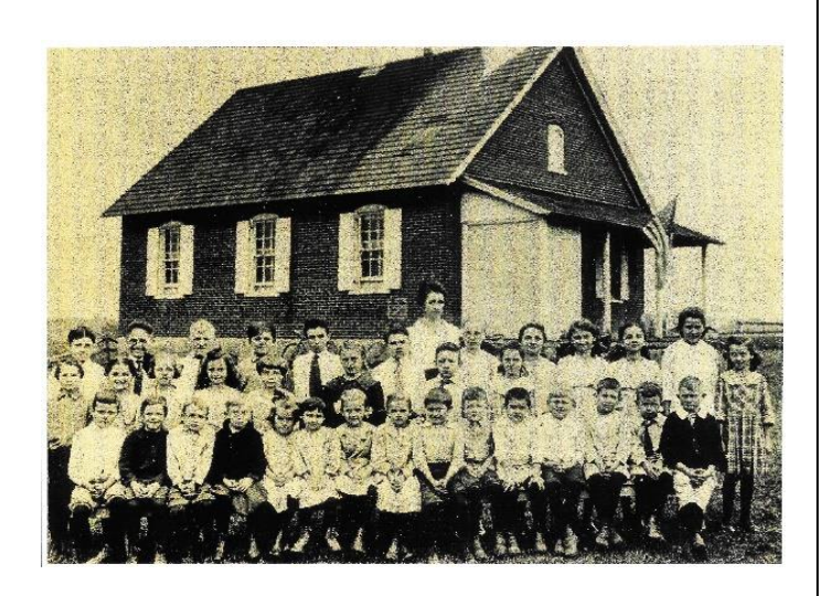
Gehman School before the fire

she noticed smoke wafting across the adjacent field. At first, she wasn't alarmed, but in time, the amount of smoke increased. She went outside to investigate, only to find flames bursting through the roof and cupola that held the school bell.