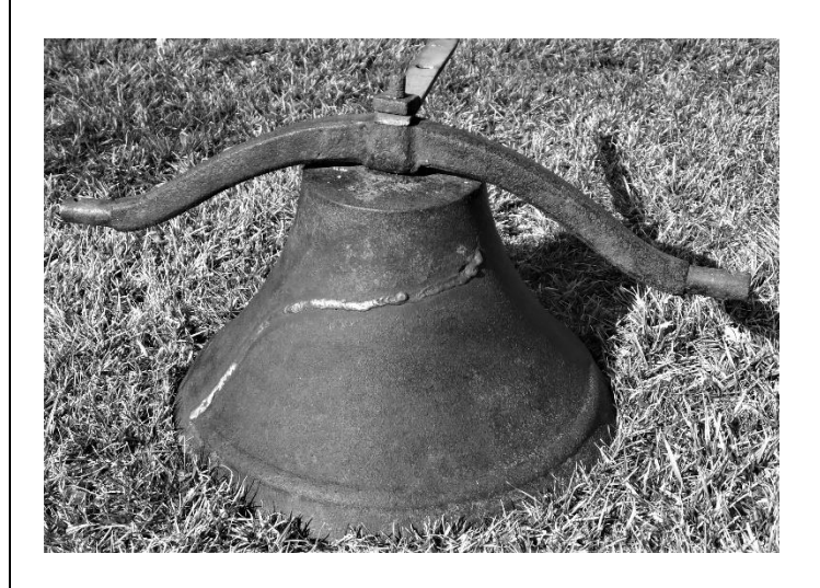
The damaged bell, today

Now, we recently received a damaged school bell as a donation. Its origin is unknown, but we were told it had been at a site since the 1920s, only five miles from the site of the school fire. Might we have that Gehman school bell, taken from the site? The one that crashed through the porch roof as the children were trying to save the piano?